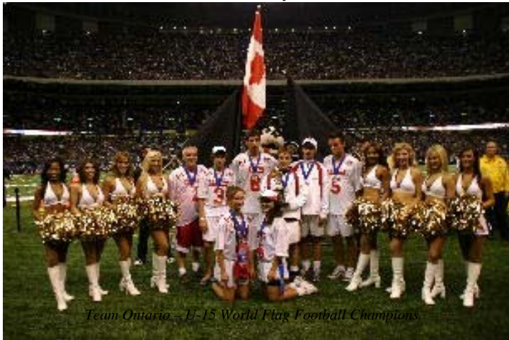
Team Ontario – U-15 World Flag Football Champions

Canada was a standout not only as the best team in the tournament but also the only one