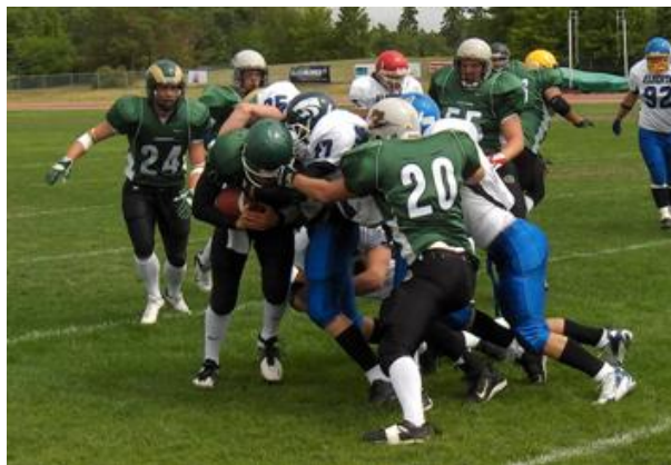
Gang Tackle – Football Canada Cup – Winnipeg, Manitoba, July, 2006

Please send us any photos you would like posted to our photo gallery.