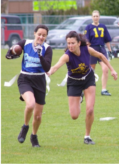
Sunbowl XXI June 24, 25 – 2006 Cowichan Valley, BC

Please send us any photos you would like posted to our photo gallery!!