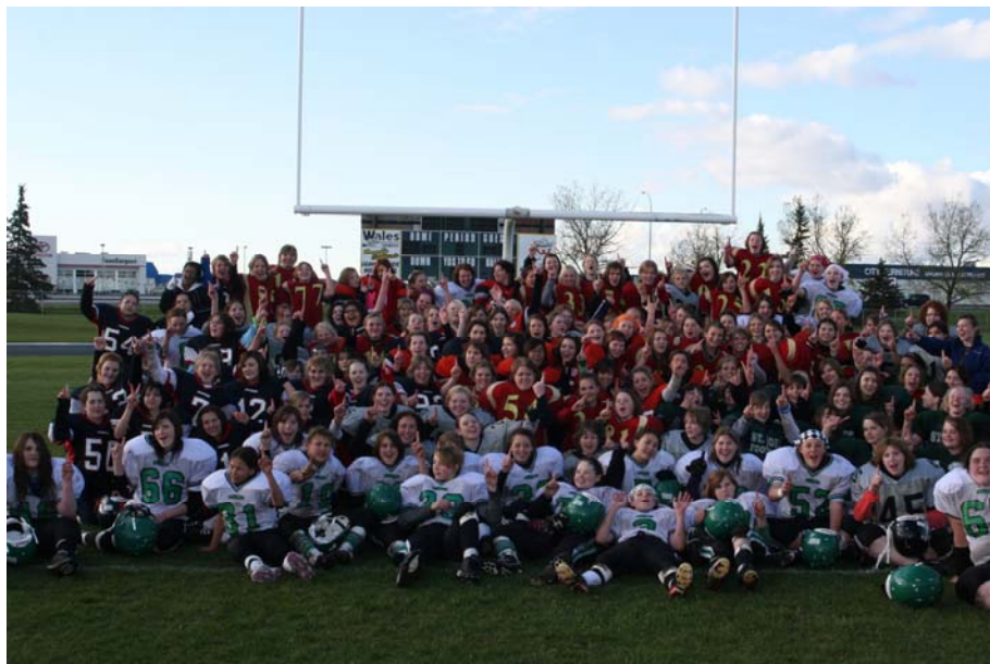
Girls' Tackle Football

Please send us any photos you would like posted to our photo gallery!!