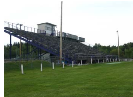
Bishop's Coulter Field

"This is an outstanding opportunity for Bishop's to showcase our facilities and to promote the region. The collaboration of Bishop's and Université de Sherbrooke will help in the development of grass roots football in the Estrie."