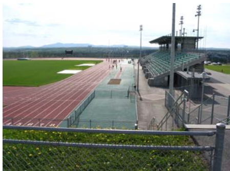
University of Sherbrooke