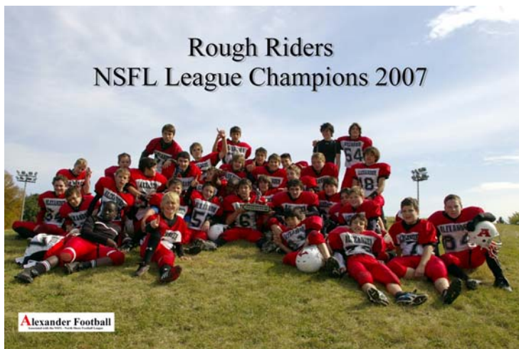
North Shore Football League Pee Wee Division Championship, Alexander Park, Pierrefonds, Quebec

Please send us any photos you would like posted to our photo gallery!!