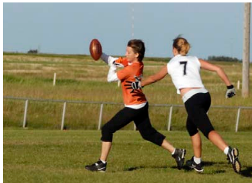
Calgary Touch Football Association