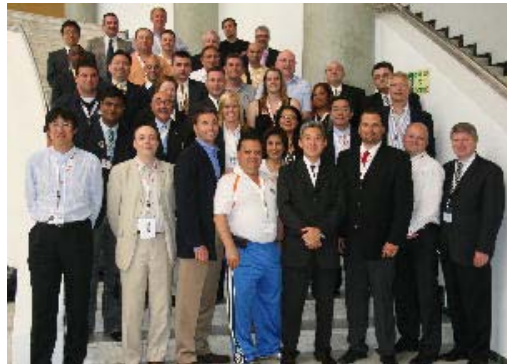
IFAF Congress delegates in Sevilla

The election was held at the annual IFAF Congress in the southern Spanish city of Sevilla. A record number 28 nations were represented at the congress with the number of countries represented within IFAF increasing to a total of 52 with the ratification of the Bahamas, Brazil, India, Hungary and Turkey as full members. Bulgaria received temporary membership. For more information please visit: www.ifaf.info/newsprint.php?ID=235