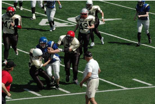
Storm and Fearless in Calgary