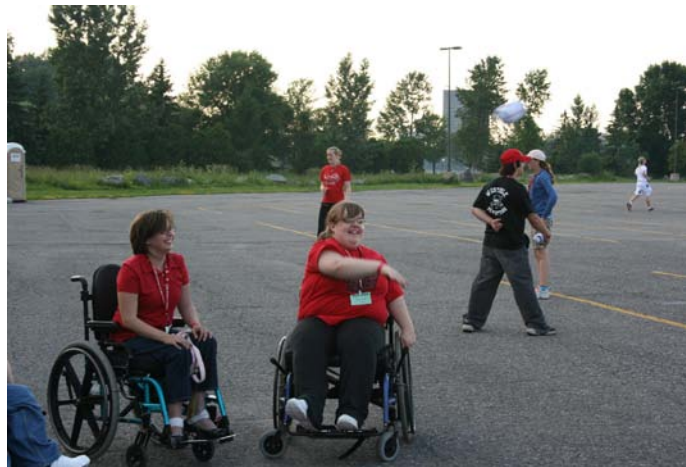
Active Living Alliance – Youth Exchange Ottawa 2008