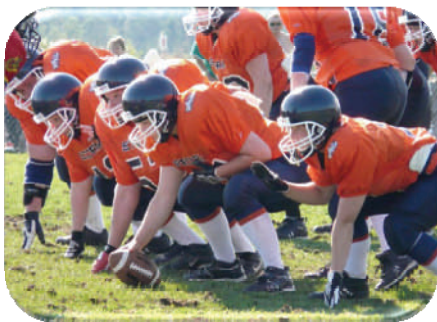
Maritime Women's Football League Saint John Storm Offensive Line vs. the Capital Area Lady Gladiators July 19

Football Canada Gear is now available. Hoodies, t-shirts, shorts and more can be found at www.footballcanada.com